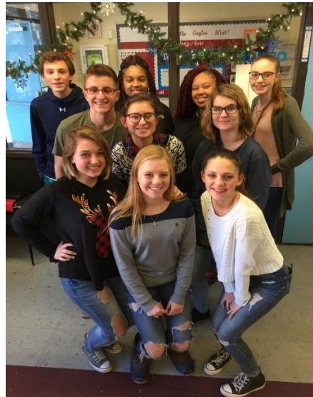
North Dorchester High School students selected for All-State Chorus