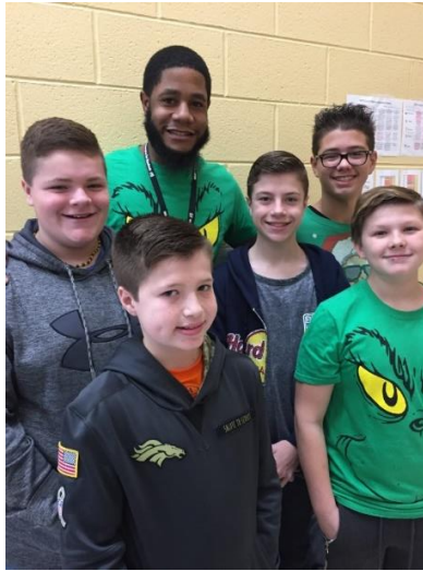
North Dorchester Middle School students selected for the All-State Chorus