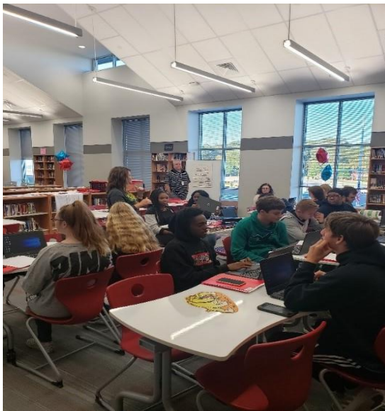
NDHS students learning about applying to college.